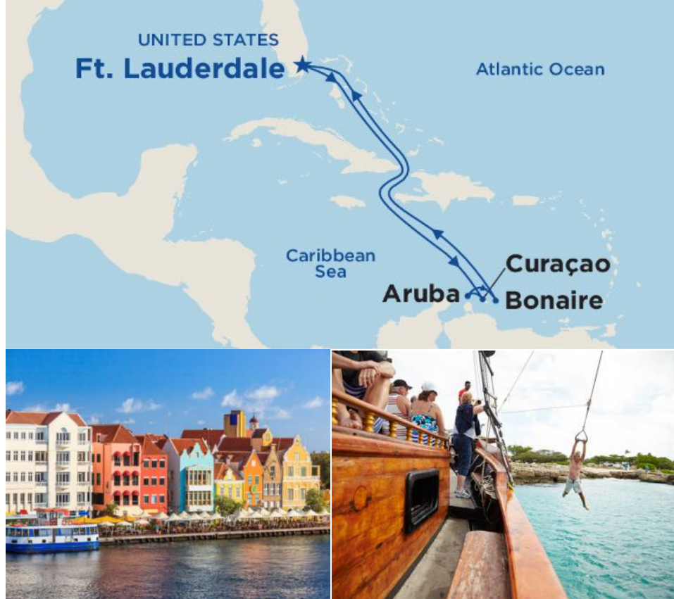
*All fares are per person plus tax, based on double occupancy and are subject to availability and capacity controlled. FREE Beverage packages may be available 6/21 - 7/5, subject to availability. Agent not liable for errors or omissions or changes to Princess Cruises rates, schedules, inclusions or policies.